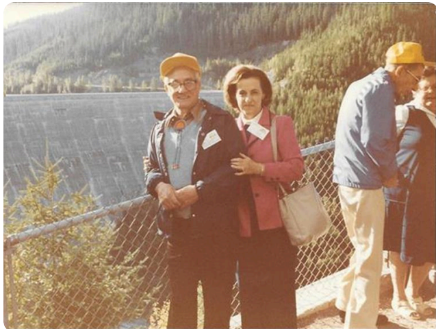
41st Div Convention