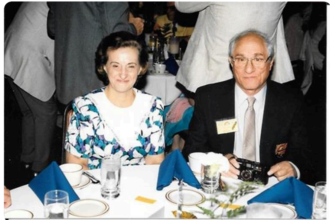
41st Div Convention